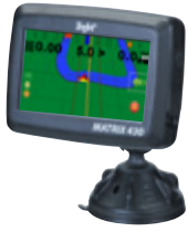
MATRIX 430 CONSOLE