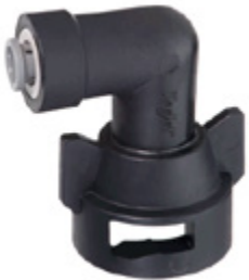
90° FIXED CAP