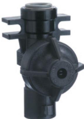
QUICK TEEJET BODY