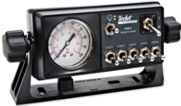
744E SPRAYER CONTROLLER

The TeeJet Technologies 744E Sprayer Controller is perfect for converting hitched sprayers and small-size trailer sprayers from manual valves to electric ball valves. The 744E is available as a complete kit equipped with a back-lit pressure gauge, active boom section LED indicator, and cable kit. The 430 Ball Valve Manifold (ordered separately) is an ideal match for the 744E and is available with a wide variety of inlet and outlet fittings to work perfectly with your sprayer.