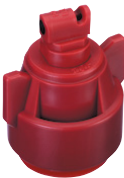
TTI Cap Assembly - TTI11004-VP-CE