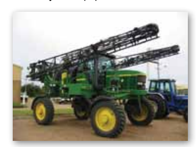
COMPATIBLE WITH MORE THAN 275 TRACTORS AND SPRAYERS

Kits include excellent instructions with plenty of photos. More than 65 vehicle-specific hook-up kits are available, making FieldPilot compatible with more than 275 tractors and sprayers.