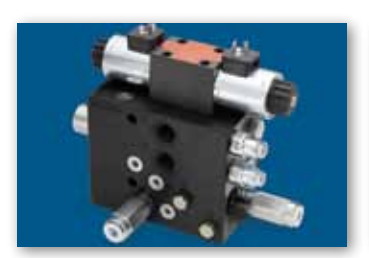
PWM STEERING VALVE

Learn more about Matrix Guidance. See Bulletin No. 98-01344-UK.