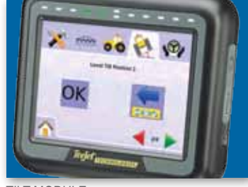
TII T MODUL F

FieldPilot is compatible with CORS or base station RTK solutions in addition to EGNOS and OmniSTAR® XP/HP.