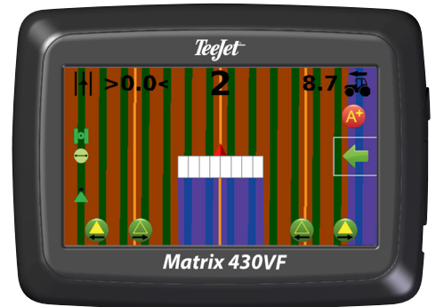
MATRIX® 430VF v1.04