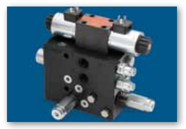
PWM STEERING VALVE

Learn more about Matrix Guidance. See Bulletin No. 98-01344.