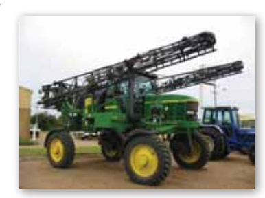
COMPATIBLE WITH MORE THAN 275 TRACTORS AND SPRAYERS

valve and components to your equipment. Kits include excellent instructions with plenty of photos. More than 65 vehicle-specific hook-up kits are available, making FieldPilot compatible with more than 275 tractors and sprayers.