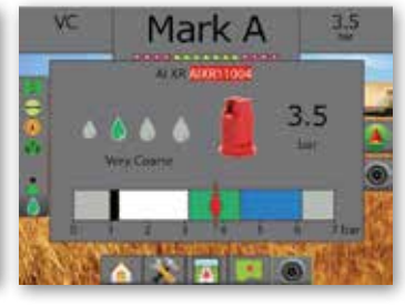
DROPLET SIZE MONITORING FUNCTION