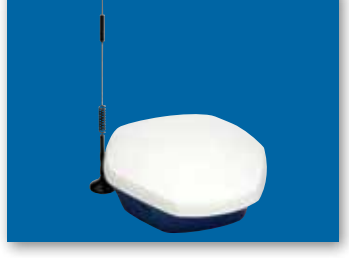
RXA-30 ANTENNA RX610 RECIEVER