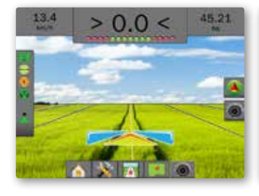
REALVIEW GUIDANCE OVER VIDEO