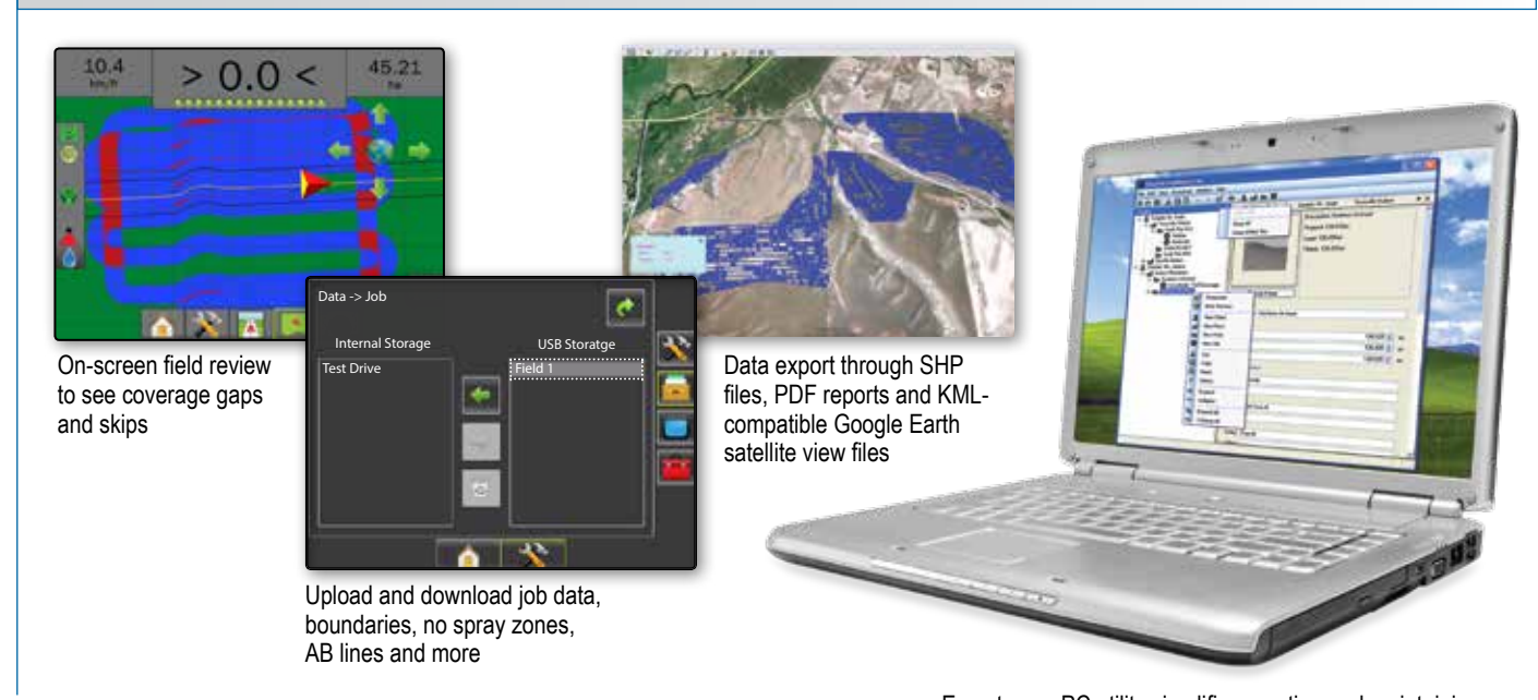
Easy-to use PC utility simplifies creating and maintaining client/farm/field/job data