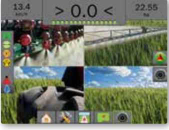
BE AWARE OF MORE BY SPLITTING THE SCREEN TO FOUR CAMERAS