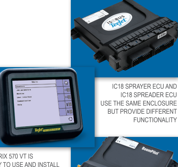
MATRIX 570 VT IS EASY TO USE AND INSTALL