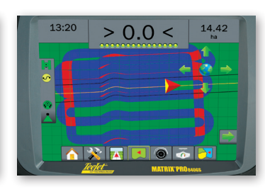
VIDEO CAN BE TURNED OFF AT ANY TIME