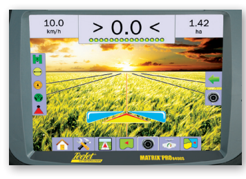
REALVIEW GUIDANCE OVER VIDEO; GUIDANCE CAN BE TURNED OFF AT ANY TIME