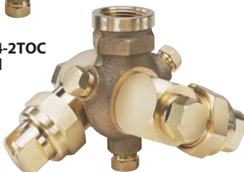
Type 4418-3/4-2TOC Double Swivel with 3/4" NPT (F) pipe connection. Brass.