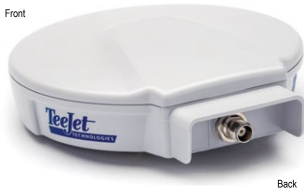
Figure 2: RXA-52 Dimensions in Millimeters