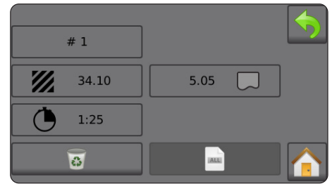
MATRIX® 430 v1.04