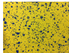
TURBO TEEJET ® (TT) (M Droplets)