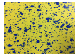
TTI TWINJET ® (TTI60) (XC Droplets)