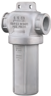
AA(B)124ML-AL (with mounting holes)