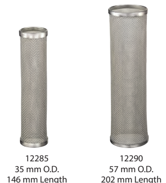
12285 35 mm O.D. 146 mm Length