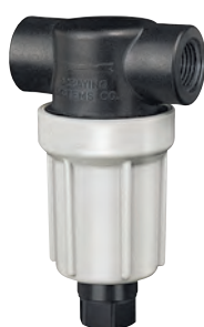
37270-122-PP Flush-Out Strainer