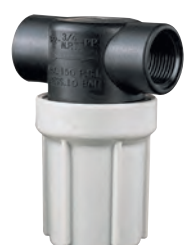
AA122-PP Compact Liquid Strainer