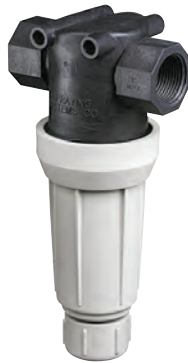
AA126ML-3 or -4