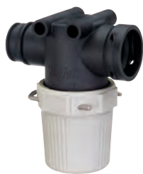
AA122ML-QC Compact Liquid Strainer