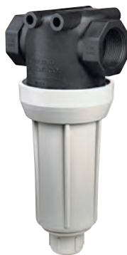
AA126ML-5 or -6