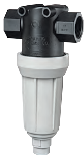
AA(B)126MLSC (Glass-filled Polypropylene)