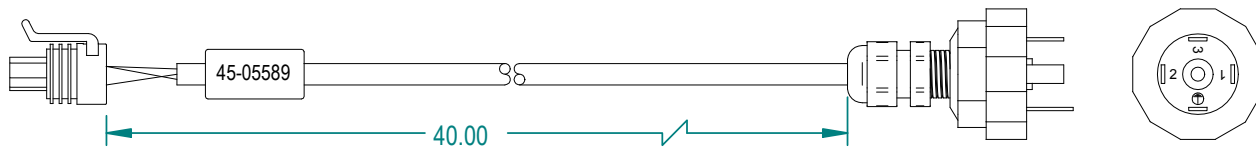
Metri-Pack Housing RND 3 pos. 150 Series