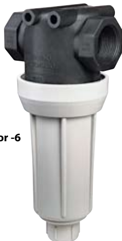
AA126ML-5 or -6