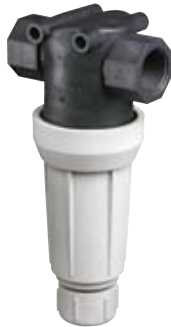
AA126ML-3 or -4