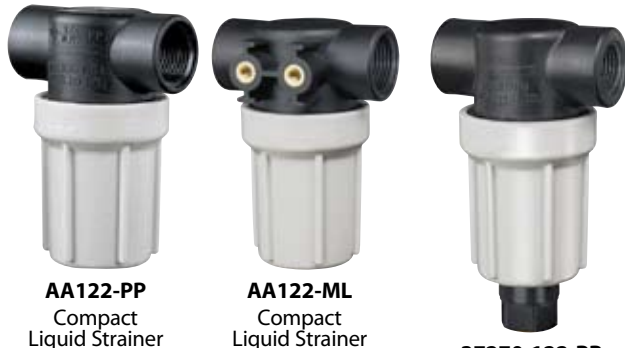
AA122-PP Compact Liquid Strainer