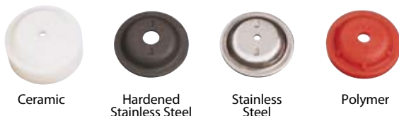
Ceramic Hardened Stainless Steel Stainless Steel Polymer

Available in a variety of sizes and materials. Ceramic for increased wear life, hardened stainless steel, stainless steel and polymer.