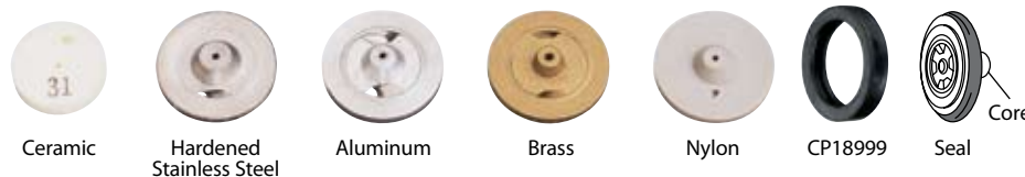
Ceramic Hardened Stainless Steel Aluminum Brass Nylon CP18999 Seal

DC13-CER, DC23-CER, DC25-CER, DC31-CER, DC33-CER, DC35-CER, DC45-CER, DC46-CER, DC56-CER.