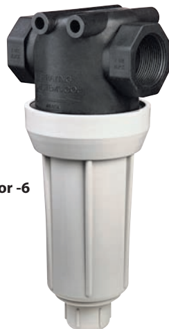
AA126ML-5 or -6