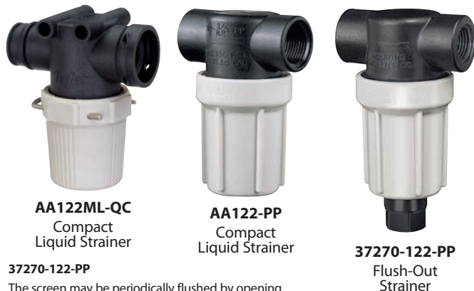
AA122ML-QC Compact Liquid Strainer