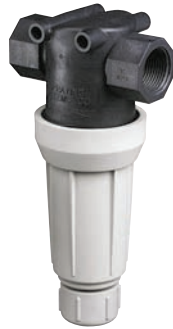
AA126ML-3 or -4