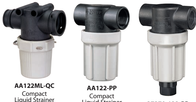
AA122ML-QC Compact Liquid Strainer