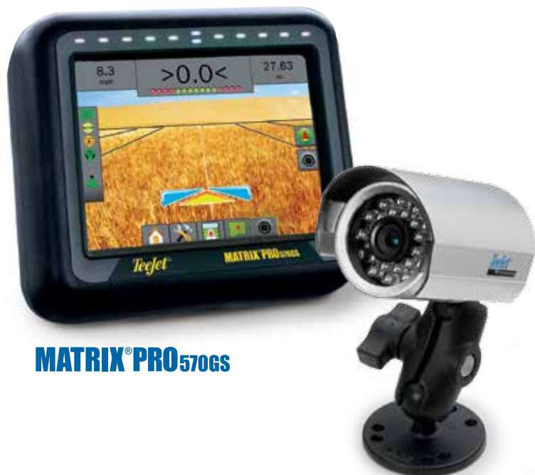
MATRIX® PRO 570GS