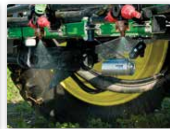
REALVIEW CAMERAS CAN BE EASILY MOUNTED ANYWHERE