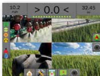
BE AWARE OF MORE BY SPLITTING THE SCREEN TO FOUR CAMERAS