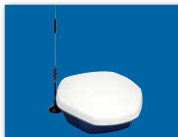
RX 610 GPS RECEIVER