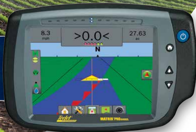
MATRIX® PRO 840GS