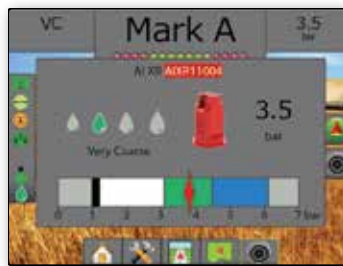
DROPLET SIZE MONITOR FUNCTION