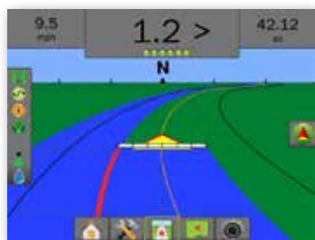
REALVIEW GUIDANCE OVER VIDEO

RAM is a registered trademark of RAM Mount