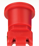
AITTJ60 SPRAY TIP

With air induction tips air is mixed with water through a venturi air aspirator that produces large air-filled droplets. When a PWM valve is used in conjunction with certain air induction tips, the mixing chamber and air inlet can fill with water as the PWM valve cycles. This can then result in water escaping out the air inlet holes, which can lead to poor distribution. New designs in air-induction tips however, have been proven to work well with PWM valves and nozzle control systems.