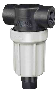
37270-122-PP Flush-Out Strainer