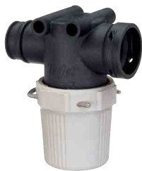
AA122ML-QC Compact Liquid Strainer