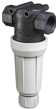
AA126ML-3 or -4