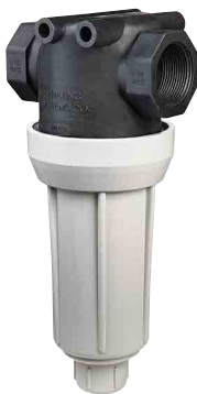
AA126ML-5 or -6