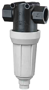
AA(B)126MLSC (Glass-filled Polypropylene)