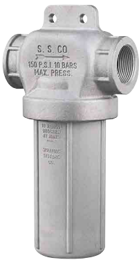
AA(B)124ML-AL (with mounting holes)