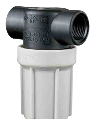
AA122-PP Compact Liquid Strainer