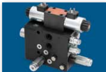
PWM STEERING VALVE

Learn more about Matrix Guidance. See Bulletin No. 98-01344.