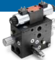
Steering Control Module