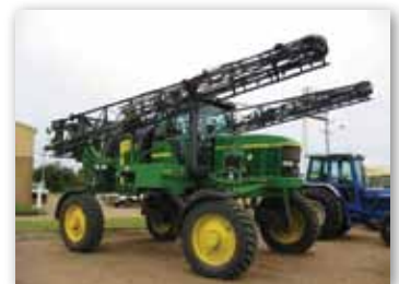
COMPATIBLE WITH MORE THAN 275 TRACTORS AND SPRAYERS

FieldPilot is designed to be owner-installed in about half a day. Each kit includes all the custom-designed brackets, hoses and fittings you'll need to fit the FieldPilot valve and components to your equipment. Kits include excellent instructions with plenty of photos. More than 65 vehicle-specific hook-up kits are available, making FieldPilot compatible with more than 275 tractors and sprayers.