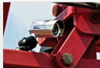
REALVIEW CAMERAS CAN BE EASILY MOUNTED ANYWHERE.