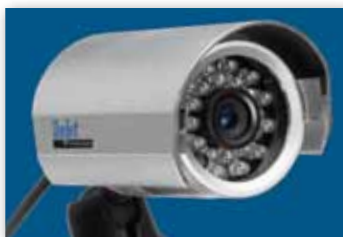
ACCOMMODATES UP TO EIGHT CAMERAS