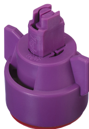
AIXR TIP AND CAP